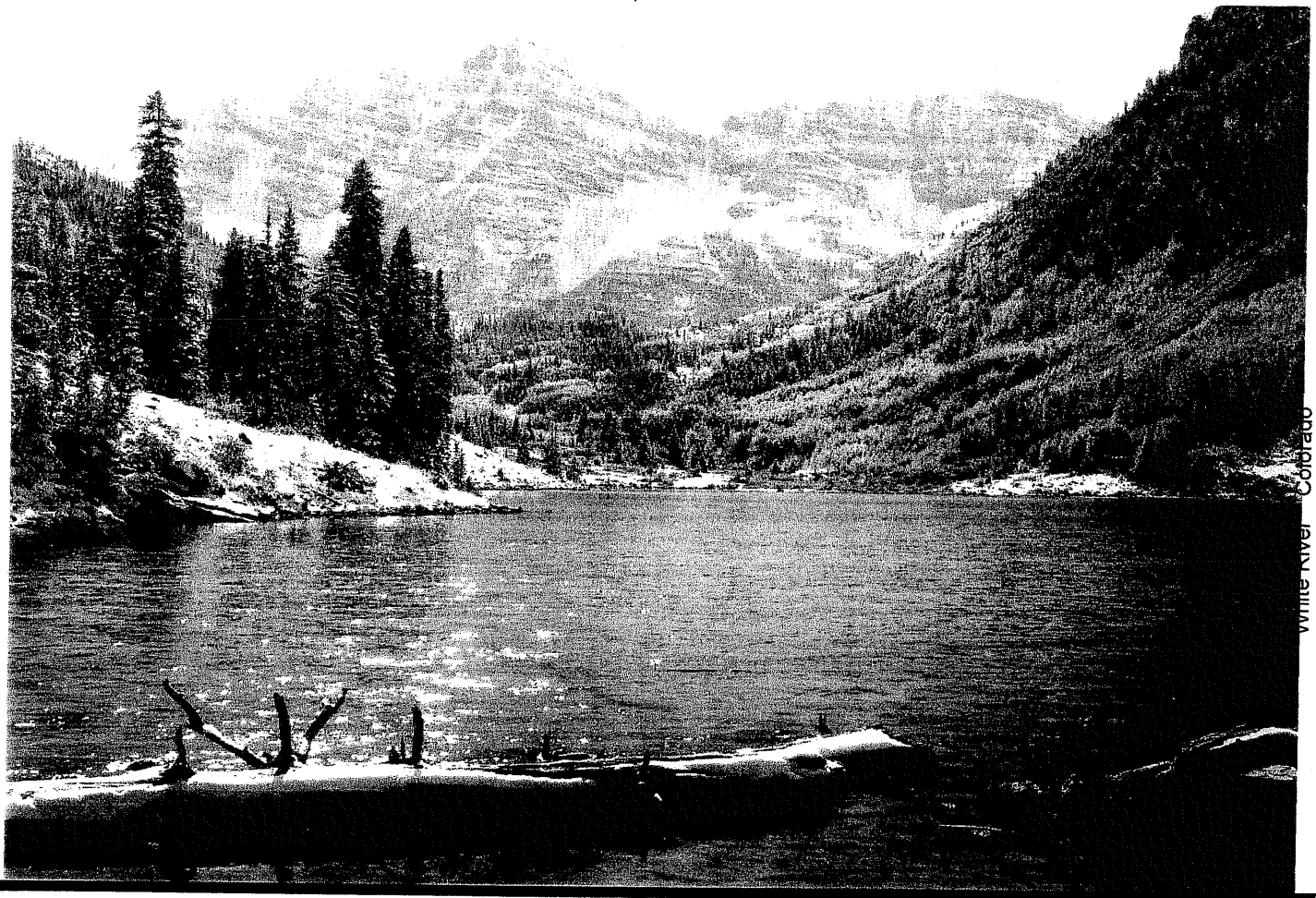
White River Colorado